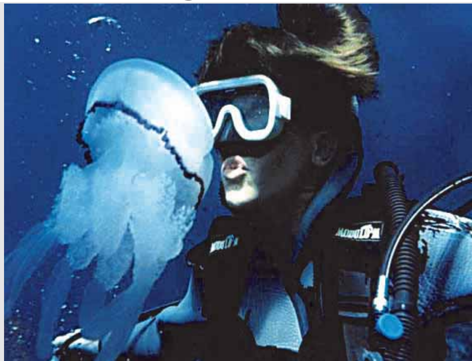
If you want to kiss a jellyfish, you are narced for sure