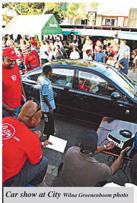
Car show at City

► City Café's 10 th Anniversary is underway this week. So far there has been lots of music, cake cutting, a car show and biker parade, the Triathlon (see page 9), free lunches and there's a lot